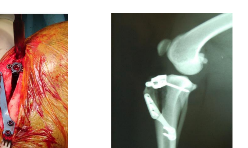
(a) (b)Figure 1. Surgical image of TTA surgical procedure (a) and radiologic study image after surgery (b).

Synovial fluid aspiration: Synovial fluid was aspirated from the operated stifle at V<sub>1</sub> (baseline) and V<sub>4</sub> (10 weeks) (Table 1). Aspiration was performed intraoperatively before the arthrotomy at V<sub>1</sub>, and percutaneously under patient sedation at V<sub>4</sub>. A 2-mL syringe (Injekt 2 mL/Luer Solo, BBraun, Melsungen, Germany) and 20G needle (Microdance 3, Beckton Dickinson and Company, Franklin Lakes, NJ, USA) were used.